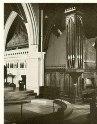
Grace Episcopal Church Amherst, Massachusetts