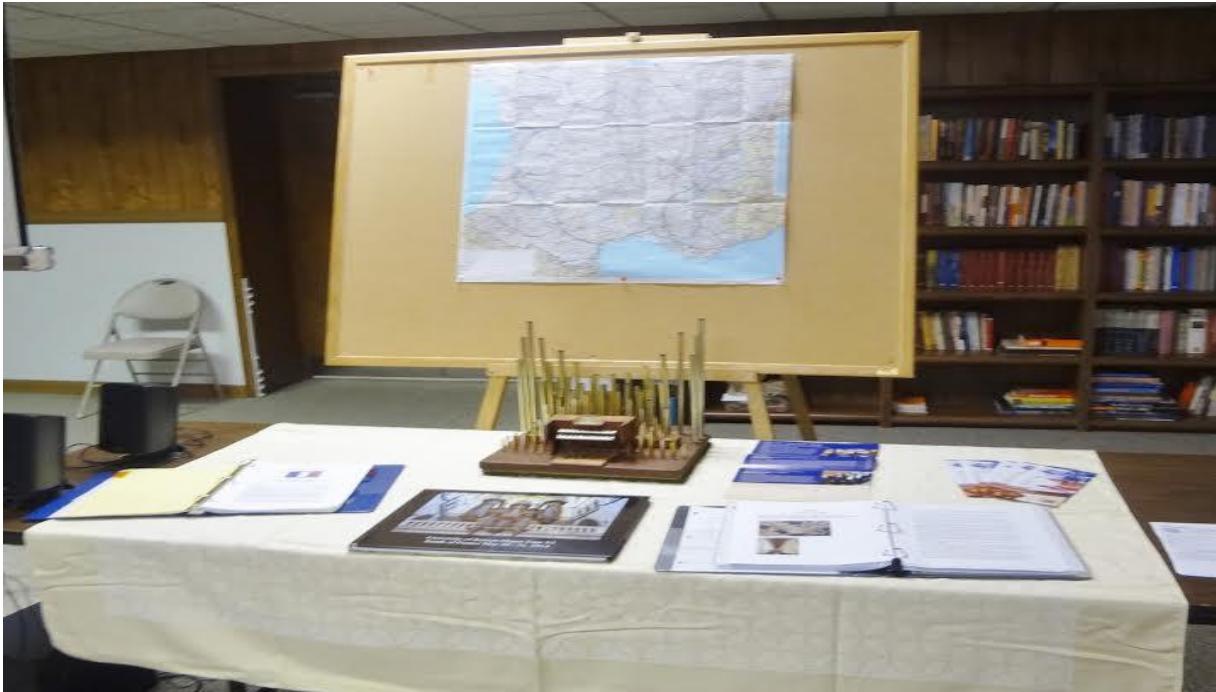
Jean's Presentation Table