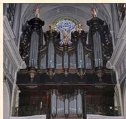
Notre Dame de Metz 1903 Cavallé-Coll/Mutin 3/38, expanded to 3/48 One of the many superb organs available to Hauptwerk users

Many of the sample sets available have been produced by Milan Digital Audio, present developers of the Hauptwerk virtual pipe organ system. Other sample sets have been produced by third party providers. Most of these sample sets have MP3 and/or .wav demos available through their providers. In addition, many very fine performances (and some less so) utilizing Hauptwerk sample sets may be found at http://www.contrebombarde.com and on YouTube. We encourage you to listen to these to discover the amazing breadth of material available. You'll be astonished at the possibilities!