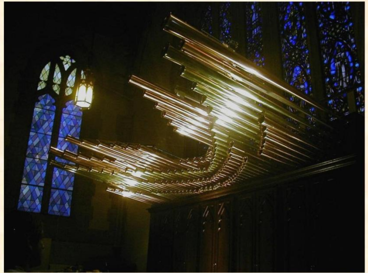
Horizontal Trumpets St. James Episcopal Church, Wilshire Boulevard, Los Angeles

44 Saint John Avenue Binghamton, New York 13905 607 237-0125 (voice and fax)