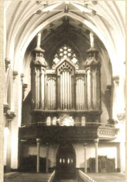
St. Mary's Church, RC New Haven, Connecticut